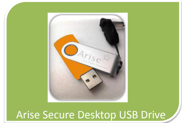
Arise Secure Desktop USB Drive

The Arise Secure Desktop is a self contained Operating System that temporarily replaces your current operating system while the Arise Secure Desktop Flash Drive is in use. The steps outlined in this section will provide an overview of how to access the Arise Secure Desktop on your machine and will need to be performed each time you wish to access the Arise Secure Desktop.